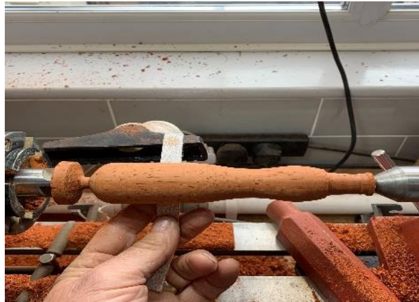
Final shape and sanding started