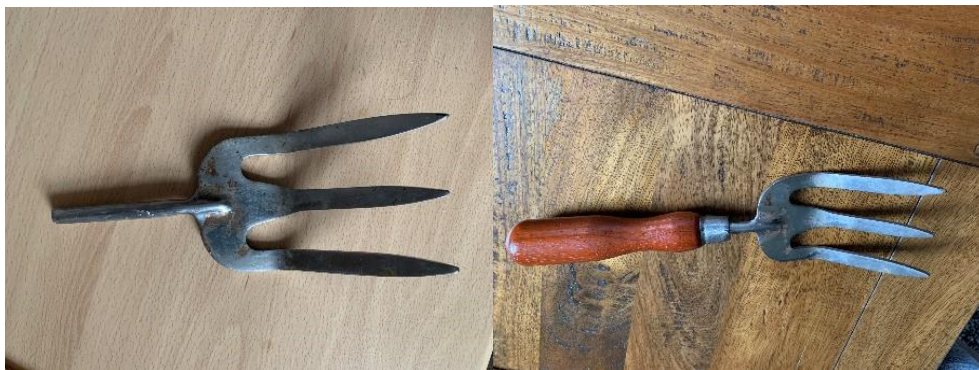
Awaiting a handle