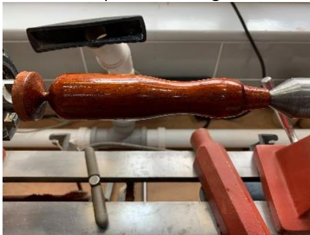
2 coats of finishing oil at this stage then 3 light coats of acrylic spray lacquer to finish with