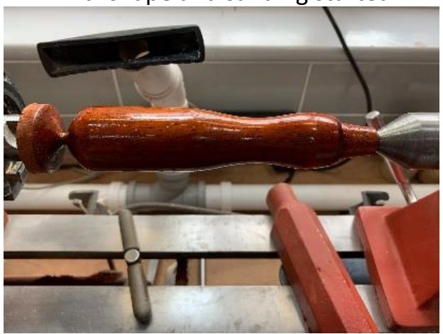
2 coats of finishing oil at this stage then 3 light coats of acrylic spray lacquer to finish with