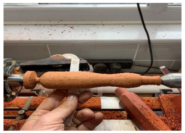
Final shape and sanding started