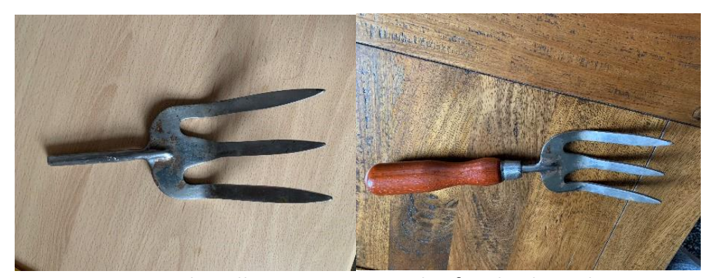
Awaiting a handle