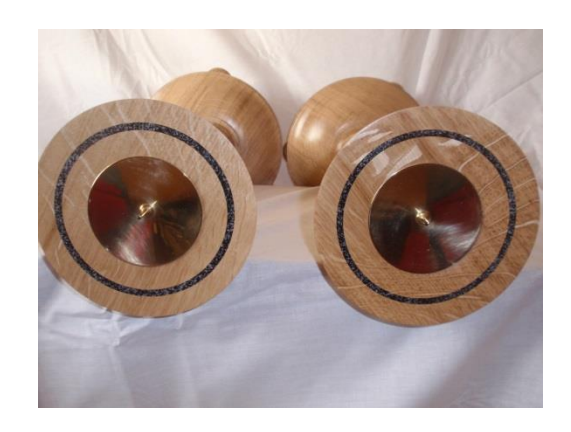
Finally glue all together using PVA glue.

Templates made and used to create the same shapes. Note a change was made with the base. Firstly I was going to make a cove base but changed it to a ogee. I felt it was better.